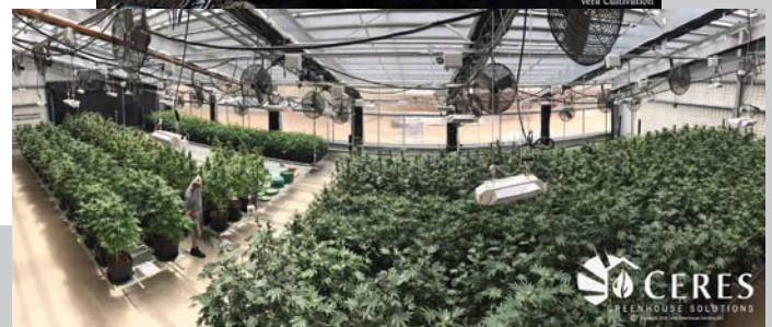
Propagation, Cloning, Veg, Drying, Stages with A.I. Monitoring & Controlling Systems