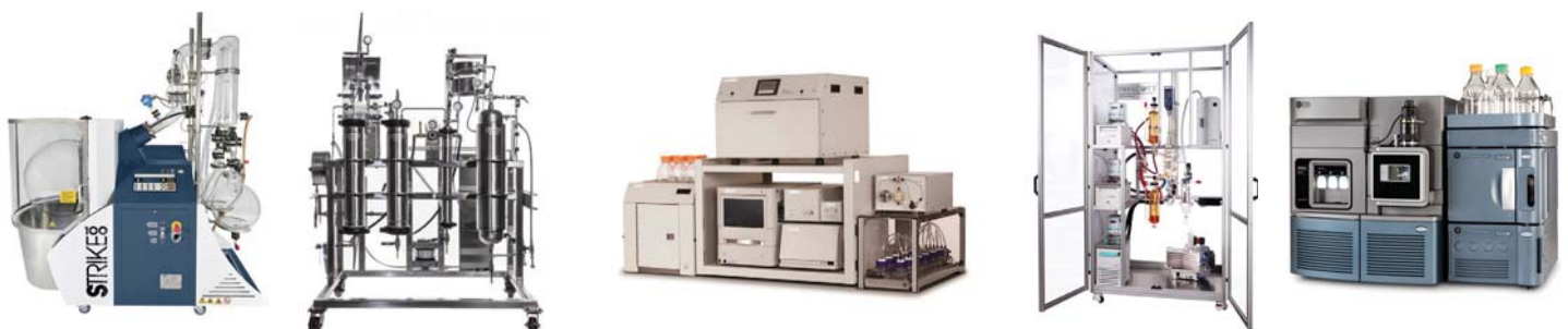
Rotary Evaporation - CO2 Extraction - Supercritical Fluid Chromatography - Short Path Distillation - UPLC